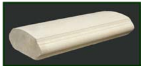
Cast-in-Place Barrier & Pilaster Caps