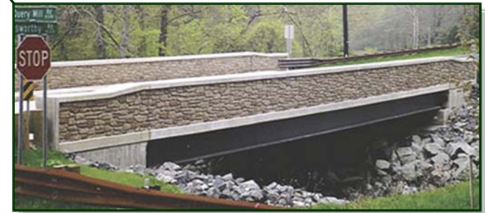
Painted or Stained Concrete "Drystack" Formliner