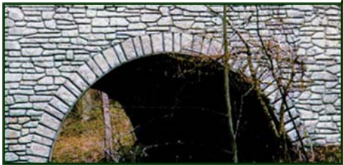
Arch Formliner Treatment