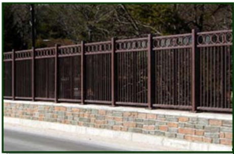
Decorative Fencing with 1" Mesh